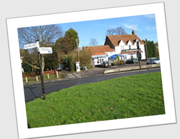
Horspath Stone Pit Charity March 2022